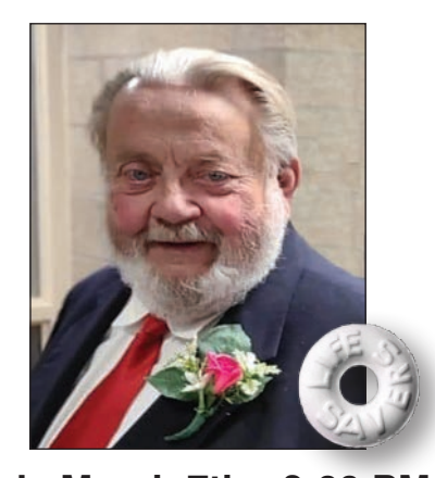
Fri., March 7th • 2:00 PM TLC - Sanctuary followed by a dessert reception